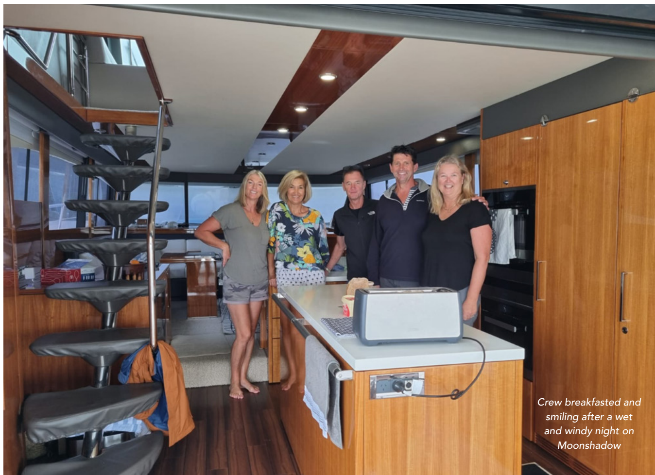
Crew breakfasted and smiling after a wet and windy night on Moonshadow

and Moon Shadow the anchor was slowly recovered to reveal the cause ....50m of sodden abandoned shipping rope hooked from the bottom of the harbour. The harbourmaster watched amazed as the huge filthy coil was hoisted aboard the bow of Lockdown. An exasperated Grant headed for the showers, I mean marina, to take delivery of one of the three new winch motors he had ordered over the weekend - philosophy being at least one would be delivered! Crisis averted Moon Shadow and Encore prepared to leave for sunnier spots, but not before Moon Shadow hooked on some abandoned chain in another part of the Harbour! The crews then headed to lovely Mapua for a spot of sun, lunch and ice cream! The benign weather however was of no help when Moon Shadow was unable to lift her anchor off the bottom of Ruby Bay, and soon she too was headed back to Nelson for a couple of nights repairs. Meanwhile back at Havelock the weather continued to encourage land based activities, like a fantastic lunch in Picton or Cloudy Bay for the crews on Cool Change and Adria.